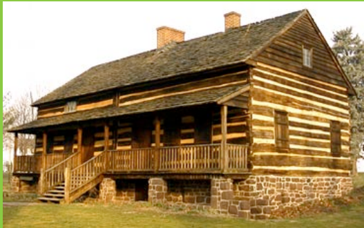
Reflecting the town's Early-American heritage, the Ferry House (tour site #28) is one of Middletown's oldest buildings.

Middletown, located halfway between Lancaster and Carlisle, was laid out in 1755 by Quaker George Fisher on the site of an earlier Native-American village. The original section of town encompassed the area between present-day Union and Vine Streets and High and Water Streets. The town was located west of Fisher's home Pine Ford, located near Swatara Creek. Incorporated as a borough in 1828, Middletown was an important 19 th century manufacturing and transportation center located along the Union and Pennsylvania Canals and the Pennsylvania Railroad.